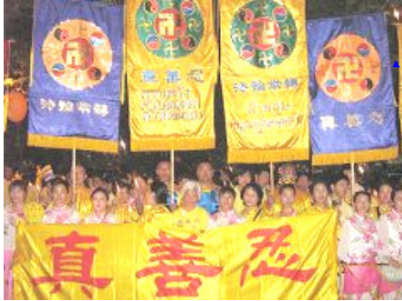
Practitioners open banners reading, "Truthfulness-Compassion-Forbearance" and "Falun Dafa in Thailand" in Chinese and Thai

The Chinese Communist Party (CCP) did not want the spread of Falun Gong in Thailand. The Chinese Embassy called the Falun Gong contact person in Thailand and threatened him about their upcoming performance. On December 3, the celebration organizers told the practitioners that their performance was canceled.